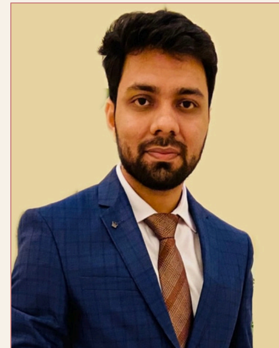
CO-FOUNDER · MENTBLUE