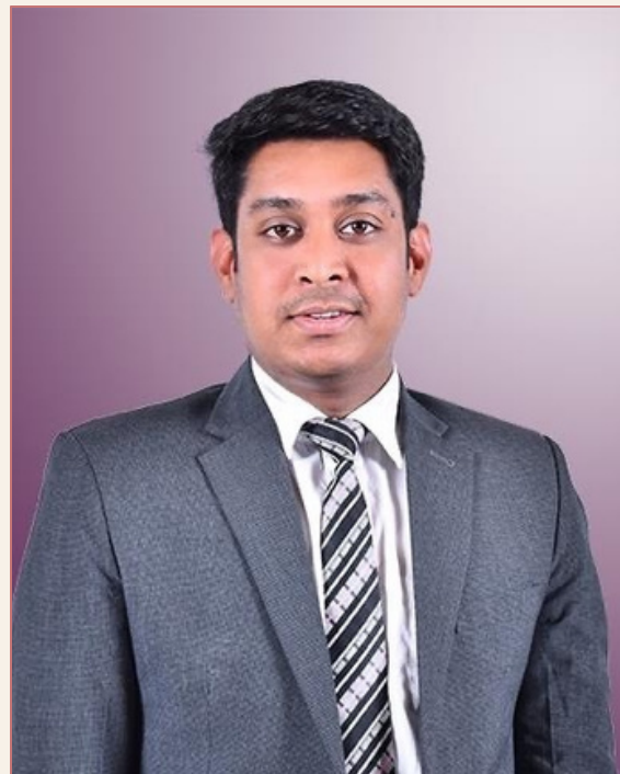
CO-FOUNDER · MENTBLUE

Day-to-day delivery of the programme - admissions, faculty coordination, participant support - is led by the Mentblue team.