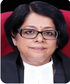
Patron-in-Chief: Justice Indu Malhotra

Hon'ble Justice Indu Malhotra is a former Judge of the Supreme Court of India. Before her elevation to the Bench, she served as a Senior Advocate at the Supreme Court and, in 2007, became only the second woman to be designated as a Senior Advocate by the Court. In 2018, she created history by becoming the first woman to be elevated directly from the Bar to the Supreme Court. Justice Malhotra is the author of a leading commentary on arbitration law and practice in India, which has been extensively cited by the Supreme Court and various High Courts in several landmark judgments. She has instituted this Chair, intending to strengthen the capacity of government officials in addressing international disputes more effectively.