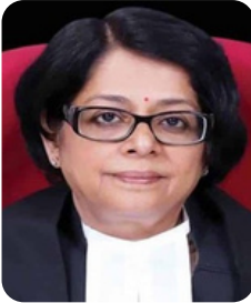
Patron-in-Chief: Justice Indu Malhotra

Hon'ble Justice Indu Malhotra is a former Judge of the Supreme Court of India. Before her elevation to the Bench, she served as a Senior Advocate at the Supreme Court and, in 2007, became only the second woman to be designated as a Senior Advocate by the Court. In 2018, she created history by becoming the first woman to be elevated directly from the Bar to the Supreme Court. Justice Malhotra is the author of a leading commentary on arbitration law and practice in India, which has been extensively cited by the Supreme Court and various High Courts in several landmark judgments. She has instituted this Chair, intending to strengthen the capacity of government officials in addressing international disputes more effectively.