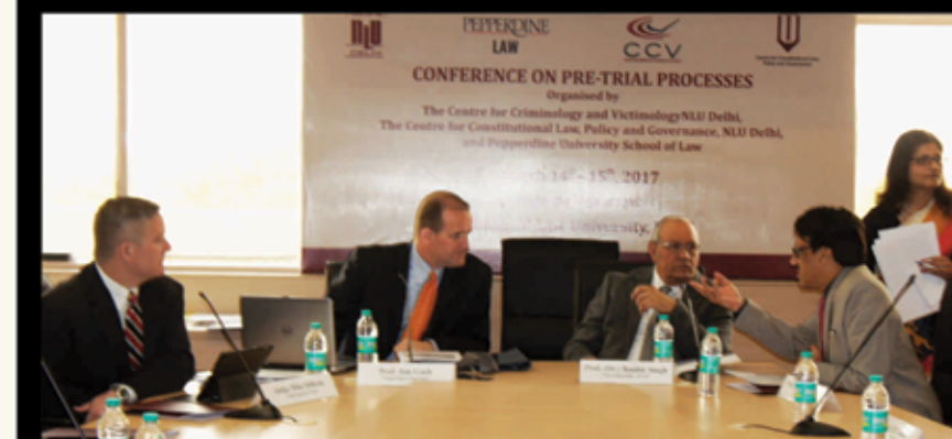
Conference on Pre-Trial Processes March 2017