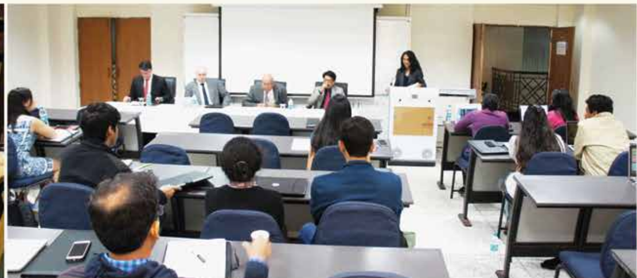
Summer School on Online Hate Speech