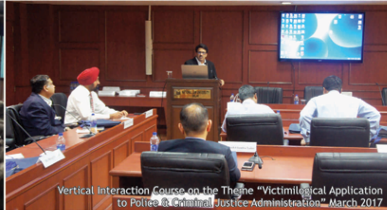
Vertical Interaction Course on the Theme "Victimological Application to Police & Criminal Justice Administration" March 2017