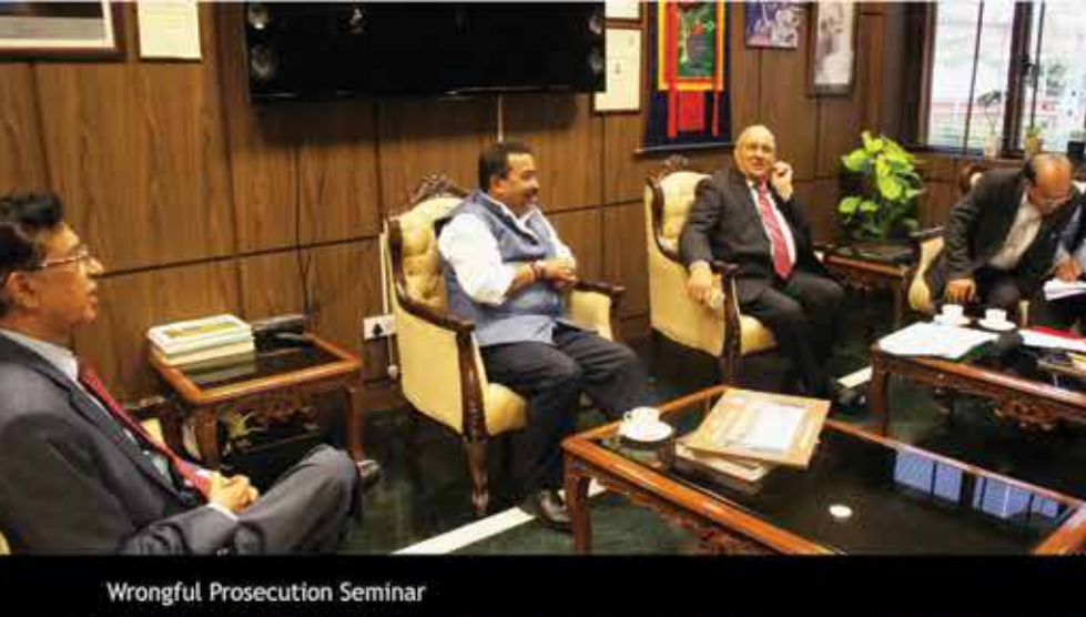
Wrongful Prosecution Seminar