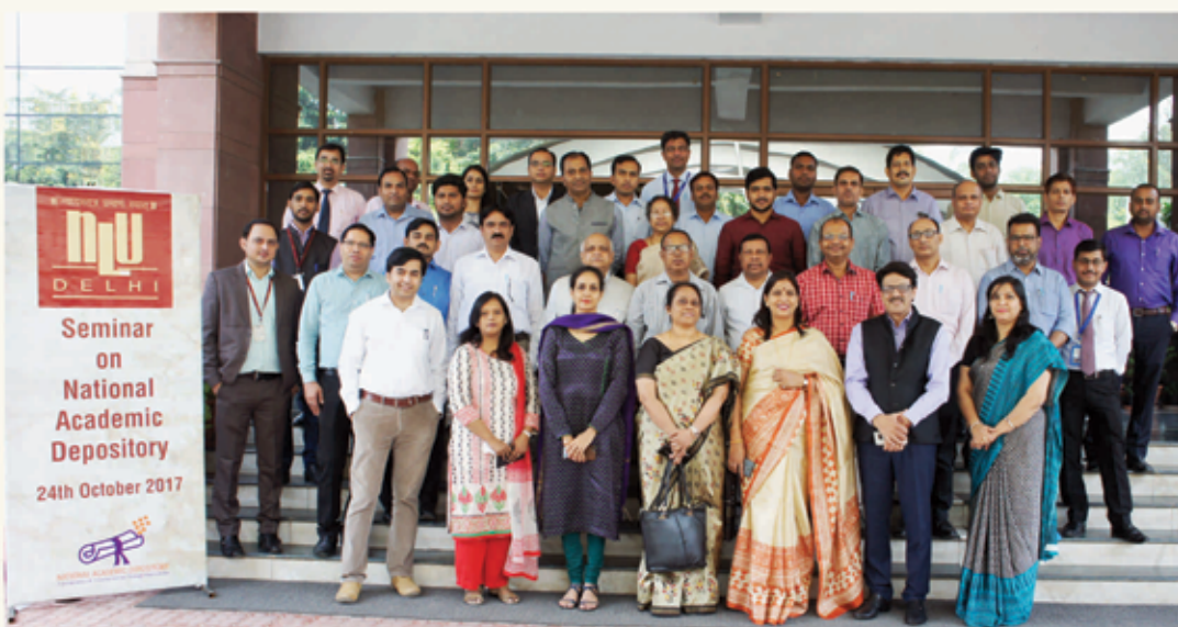
Seminar on National Academic Depository

Teachers Training Programme on Jurisprudence