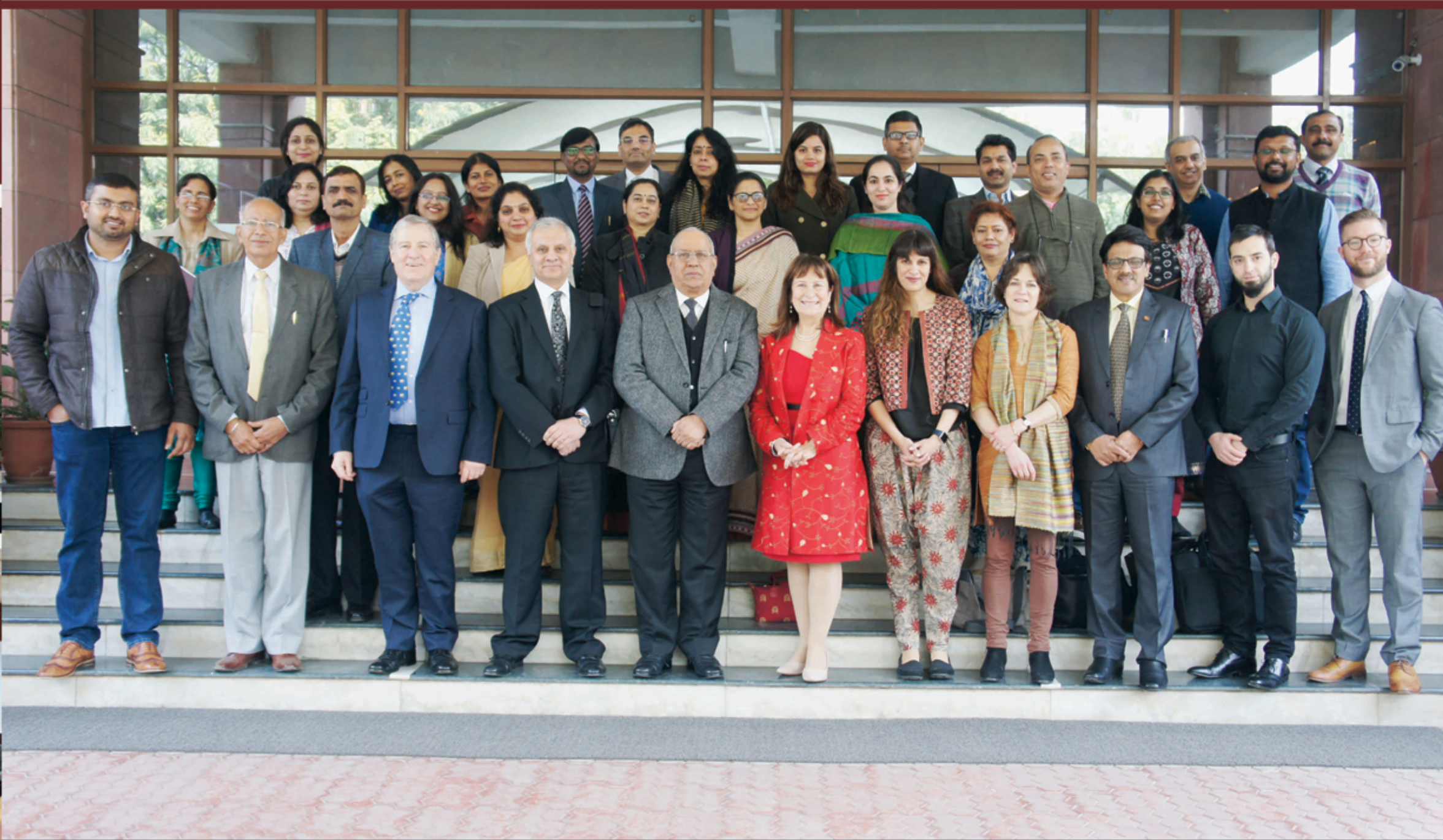
Visit of Baroness Helena Kennedy, sitting Member in the House of Lords and Special counsel to the Queen in the United Kingdom to NLUD.