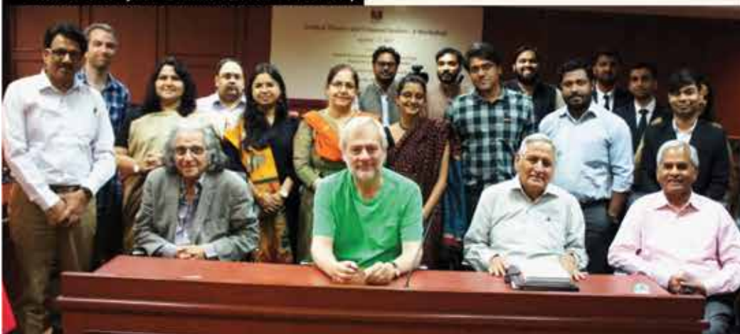
Critical Theory and Criminal Justice Workshop