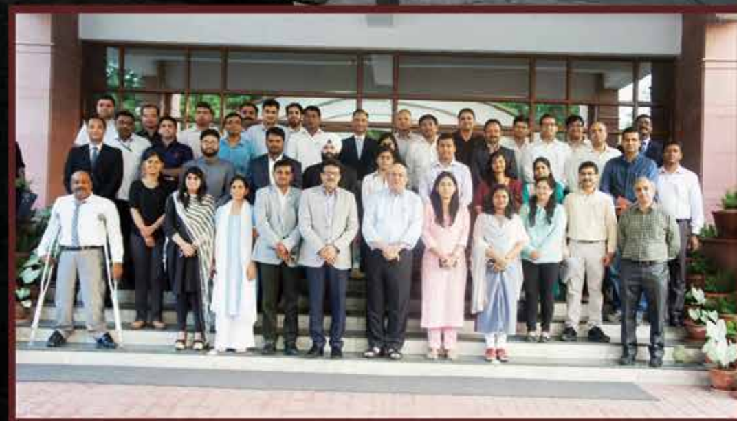
Launch of LL.M (Pro) Programme 2017

To begin with, the University has admitted a maximum of 160 candidates for the programme. However, the University reserves the right to alter the number of seats for the programme in a given academic year without prior notice.