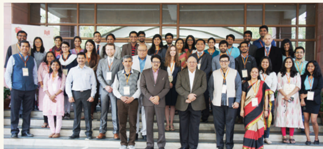
Asia Pacific Workshop on Empirical Methods in Innovation, Intellectual Property and Competition.

Workshop on Empirical Inquiries into Indian Judicial System in association with Cornell Law School, NLU Delhi