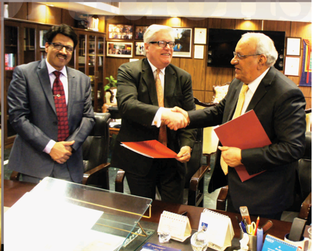
MoU with Strauss Institute for Dispute Resolution, School of Law, Pepperdine University.