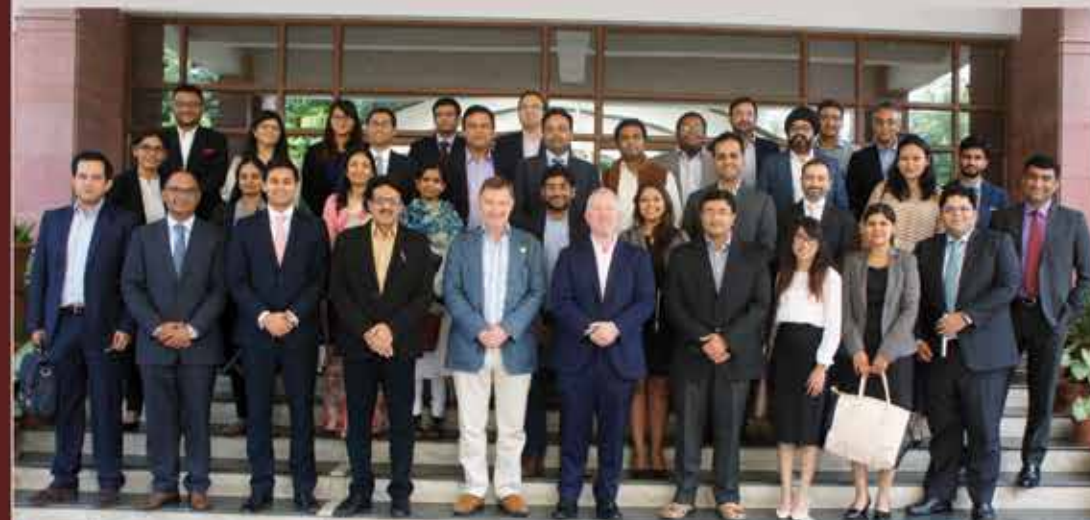
NLU Delhi-Herbert Smith Freehills International Negotiation Competition September 2017

The University may offer Short Courses for students of the B.A., LL.B (Hons.) programme in accordance with the Regulations for Short Courses.