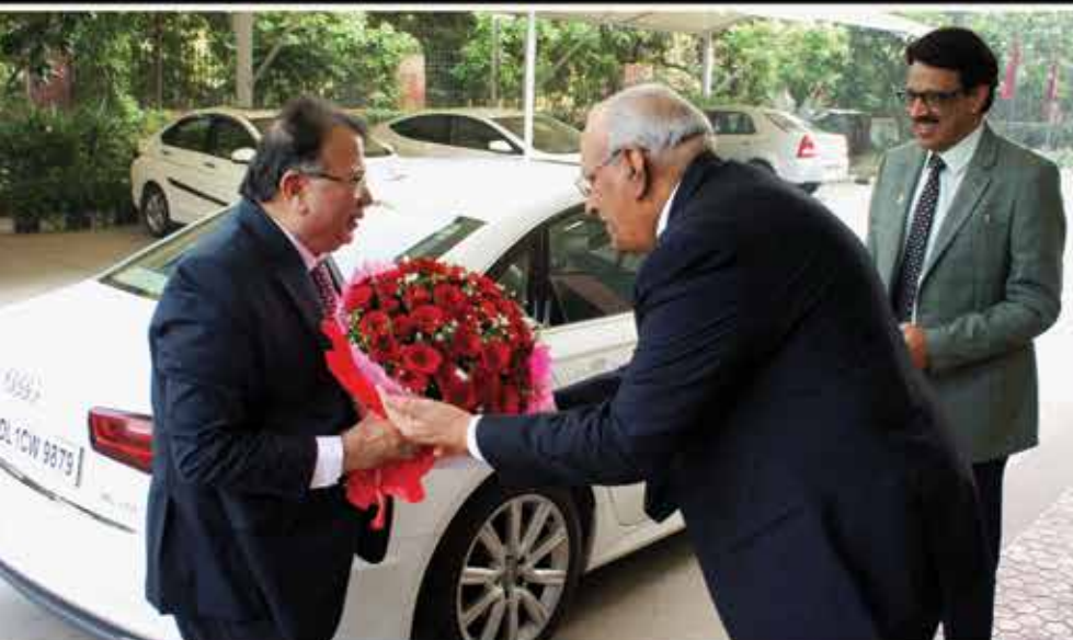
Visit of Hon'ble Justice A.K. Sikri