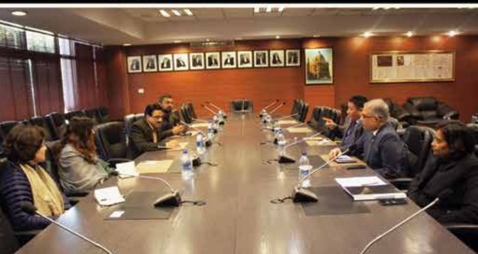
High Level Meeting November 2017