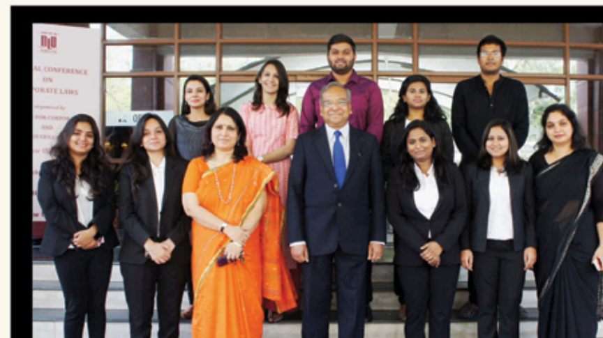
National Conference on Corporate Laws March 2017

Centre for Transparency and Accountability in Governance, (CTAG), National Law University, Delhi in collaboration with National Labour Law Association (NLLA) and Friedrich Ebert Foundation, New Delhi organised a two days National Seminar on “Labour Law in Emerging India” on November 11-12, 2017.