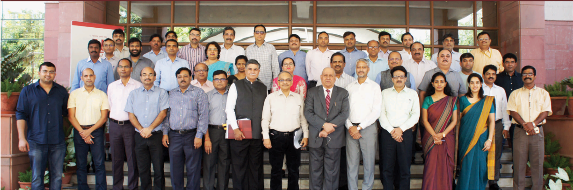
Capsule course on Legal Aspects & Legal Matters for Indian Revenue Service Officers, September 2017