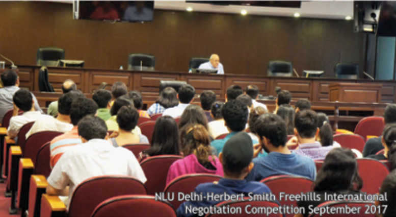
NLU Delhi-Herbert Smith Freehills International Negotiation Competition September 2017