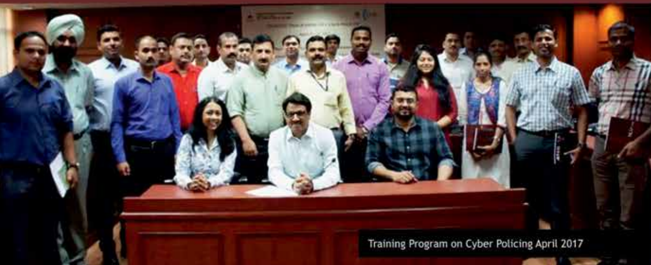
Training Program on Cyber Policing April 2017

'Law Teachers' Declaration on Jurisprudence Curriculum' was the most significant, concrete and immediately visible outcome of the programme, which is expected to inform our vision of and engagement with jurisprudence in times to come.