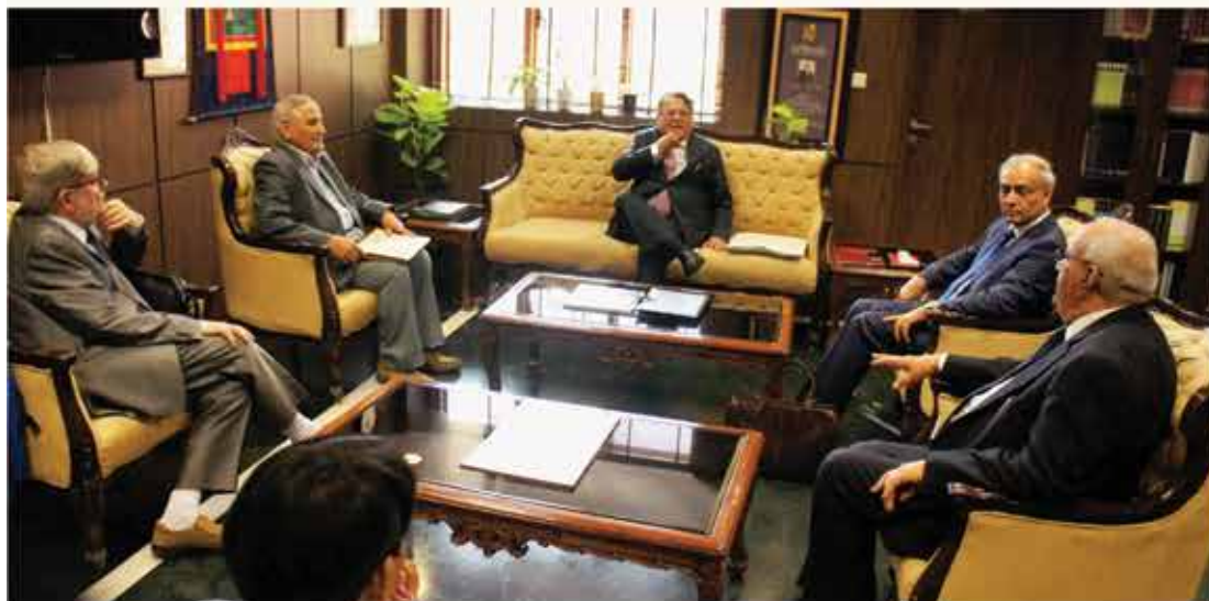
National conference on Wrongful Prosecution: Rights, Protection and Assistance.

Workshop on Empirical Inquiries into Indian Judicial System in association with Cornell Law School, NLU Delhi