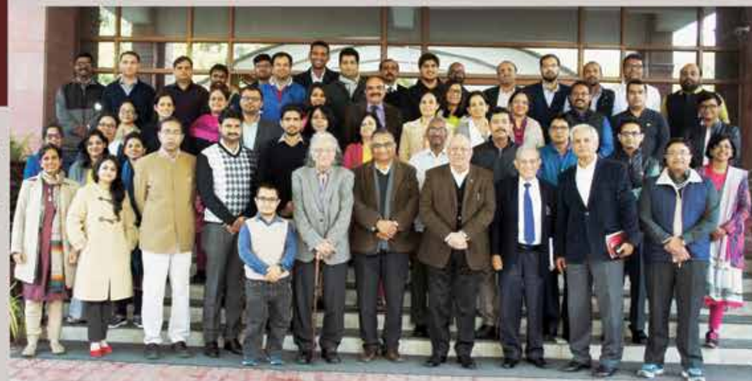
Teachers Training Programme on Jurisprudence December 2017