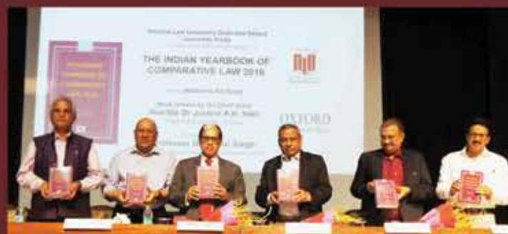
Launch of Indian Yearbook of Comparative Law 2017