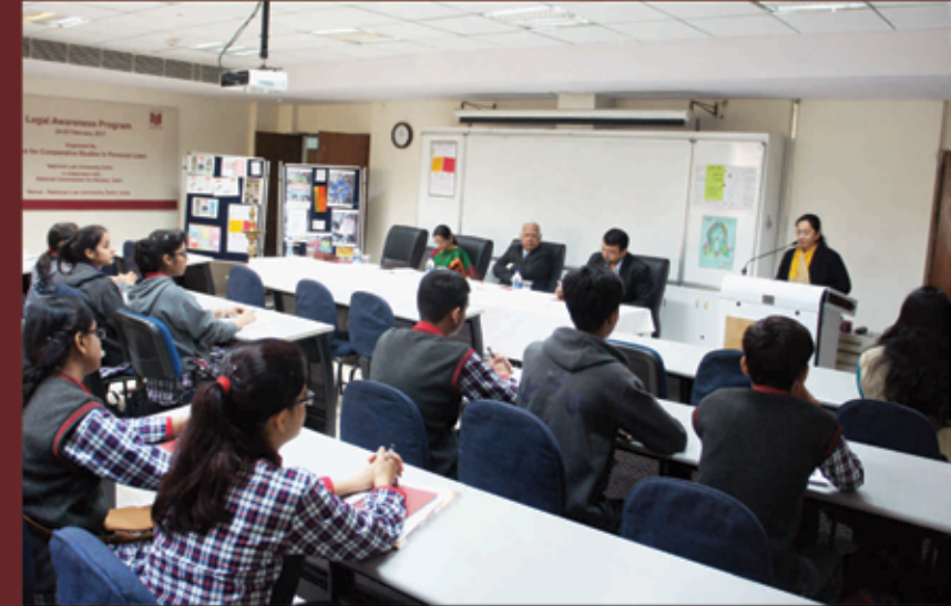
Workshop on Legal Awareness Programme in collaboration with National Commission for Women