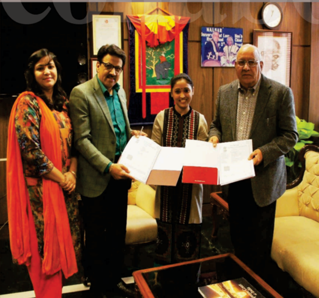
MoU signed between Sage Publications and NLU, Delhi for the publication of University Journals