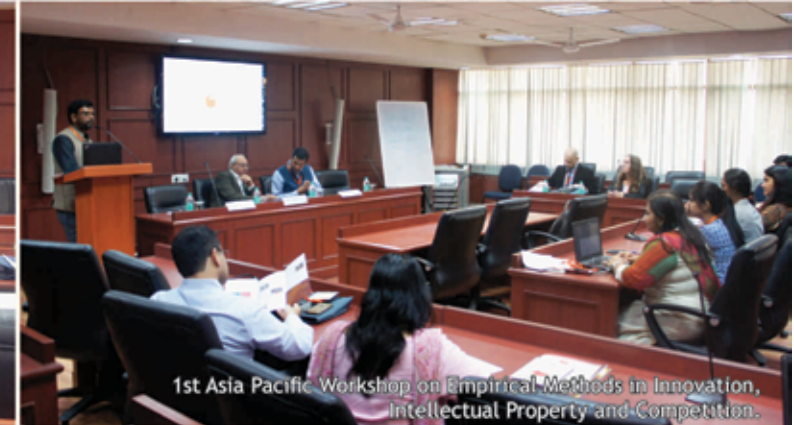
1st Asia Pacific Workshop on Empirical Methods in Innovation, Intellectual Property and Competition.