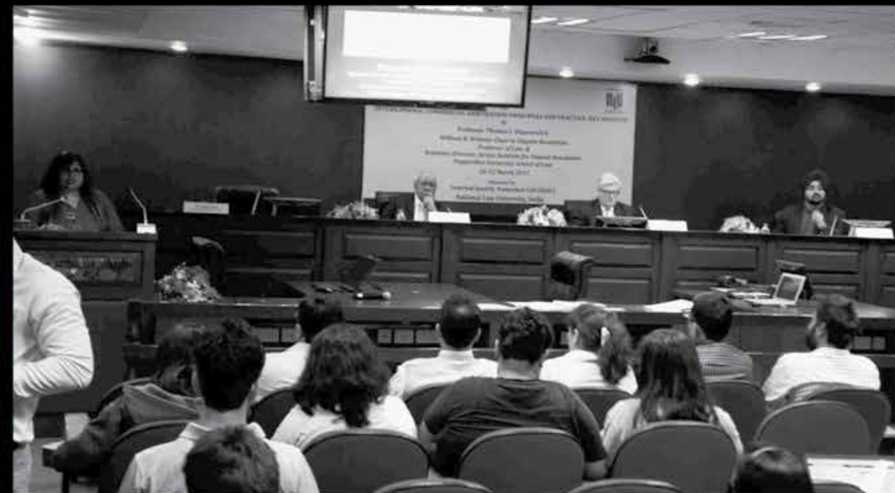
Course on International commercial Arbitration