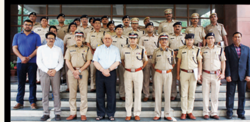
Police Training Programme