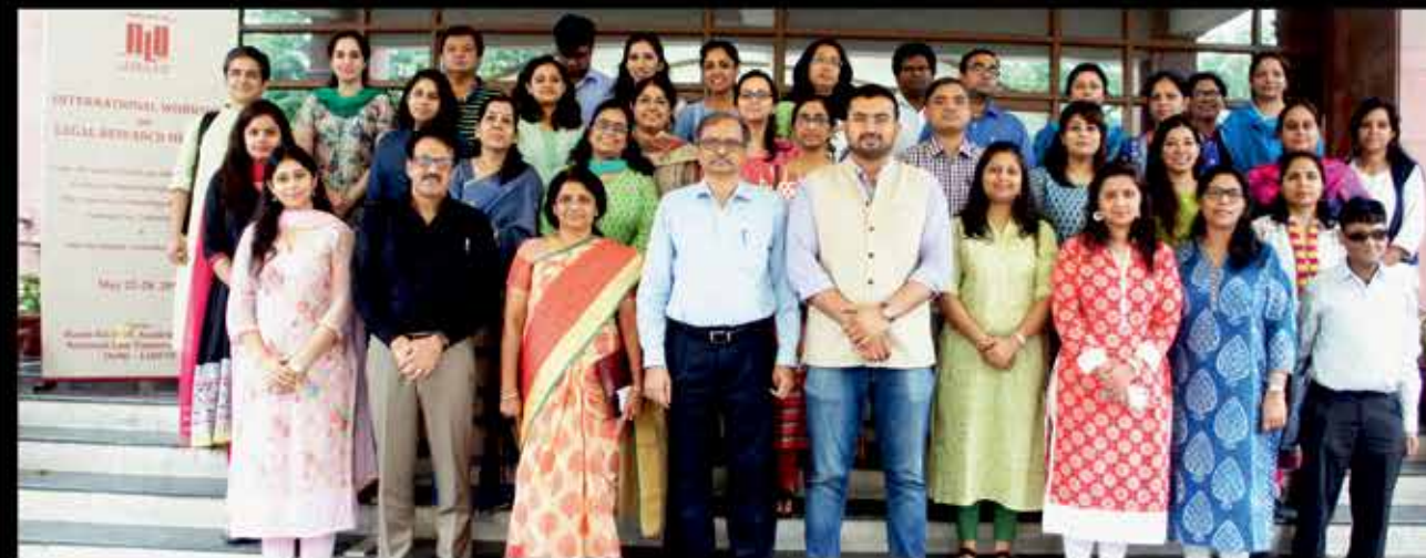
International Workshop on Legal Research Methodology

National Academic Depository (NAD) Seminar