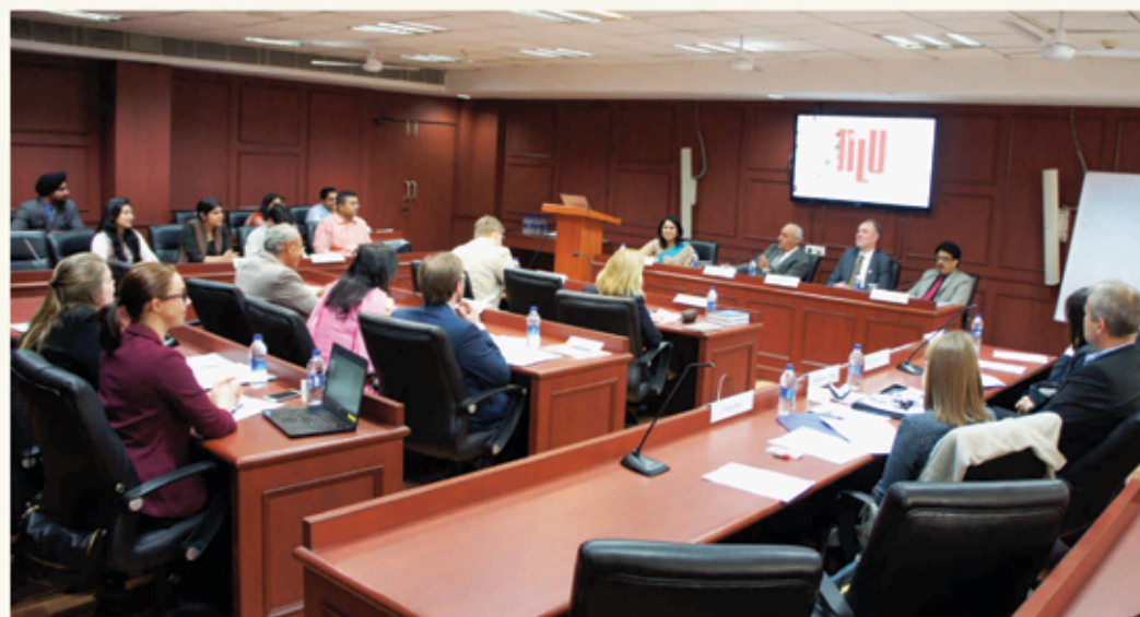
Indo-Norwegian Cooperation Programme in Law-Joint Workshop for PH.D Scholars & Researchers