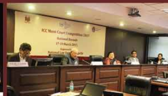
ICC Moot Court Competition 2017