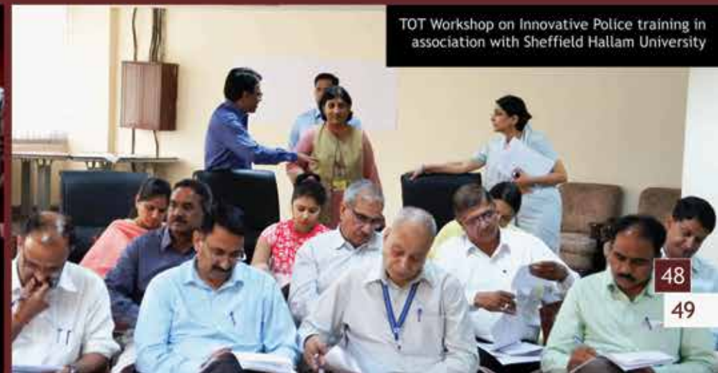
TOT Workshop on Innovative Police training in association with Sheffield Hallam University