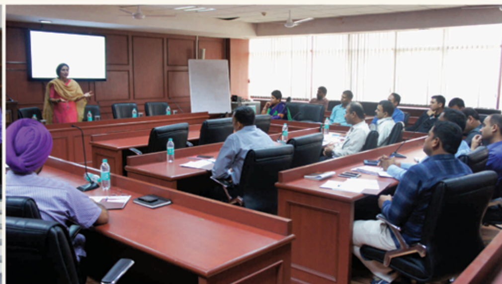
Training Program on Cyber Policing