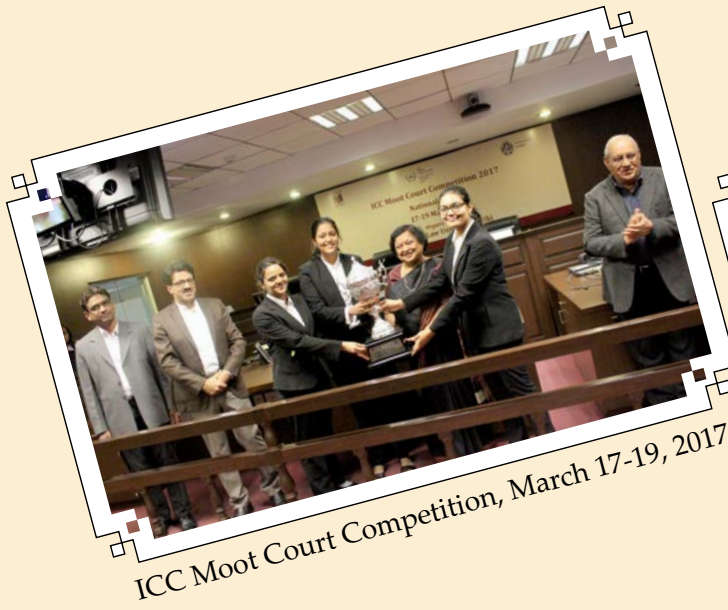
ICC Moot Court Competition, March 17-19, 2017