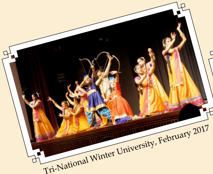
Tri-National Winter University, February 2017