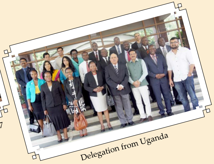
Delegation from Uganda