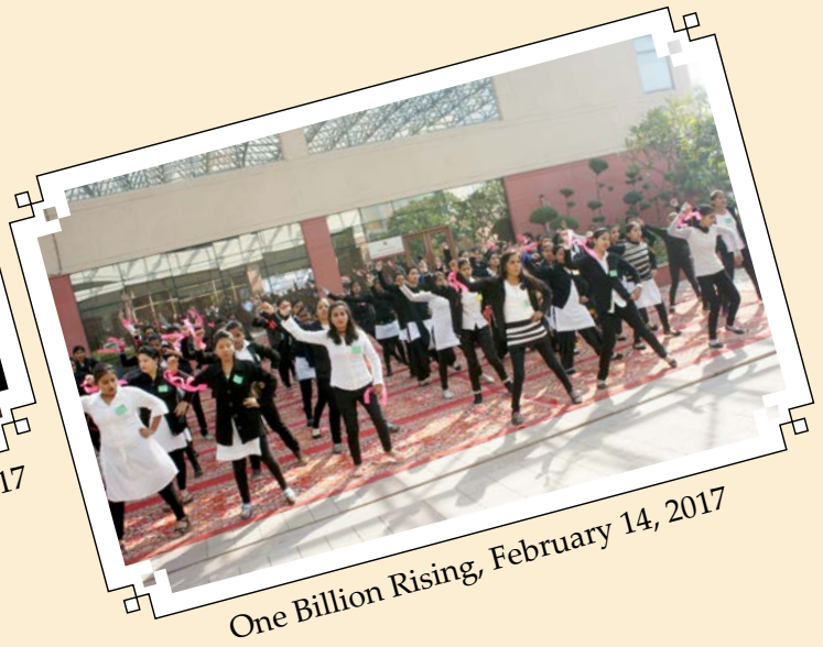
One Billion Rising, February 14, 2017