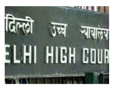
File image of Delhi High Court.